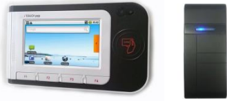
ITOUCH pop / DE-950